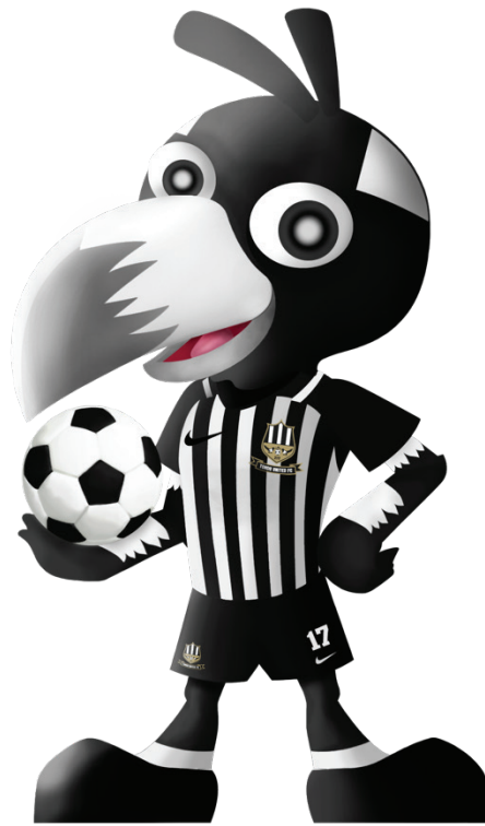
Magpie Dai Club Mascot